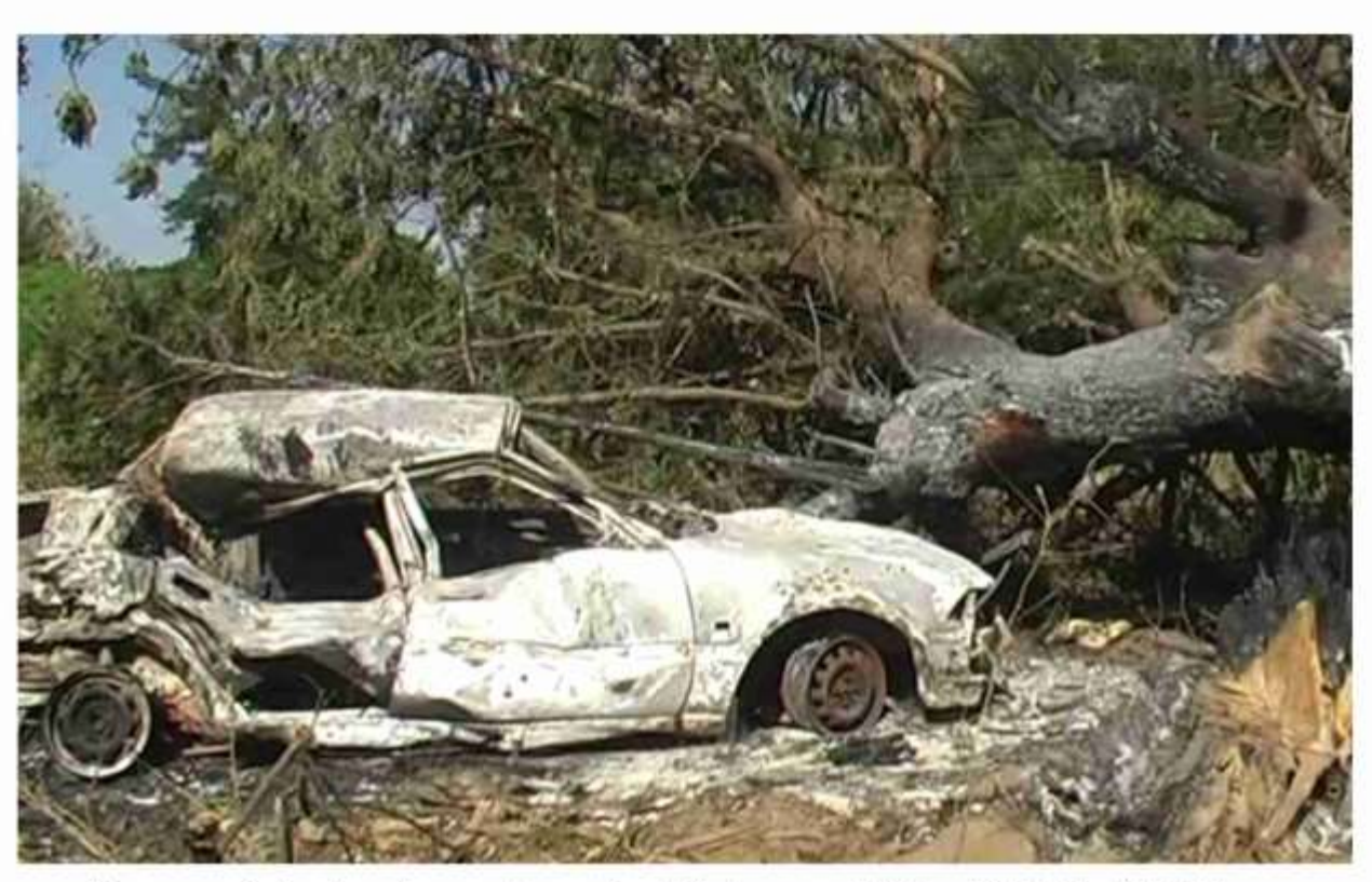
Scene of destructions along the highways linking Mubi to Michika