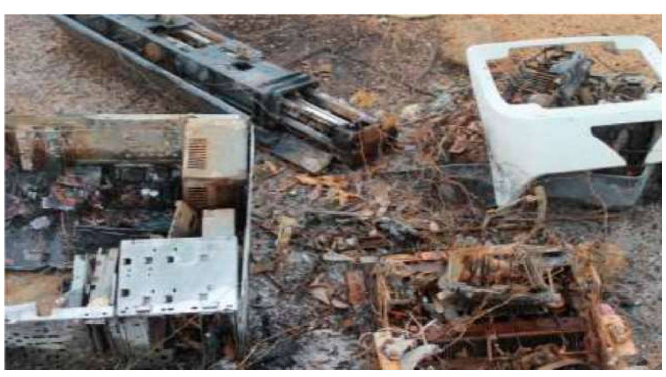
Vandalised office and Equipment at Local Education Authority