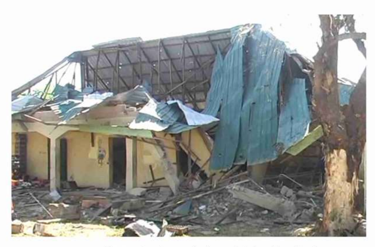
Some structures destroyed during the attacks