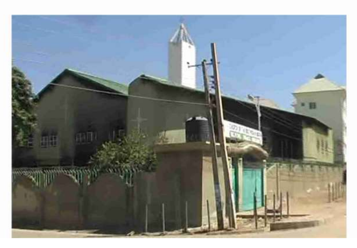
Page 5 of 10