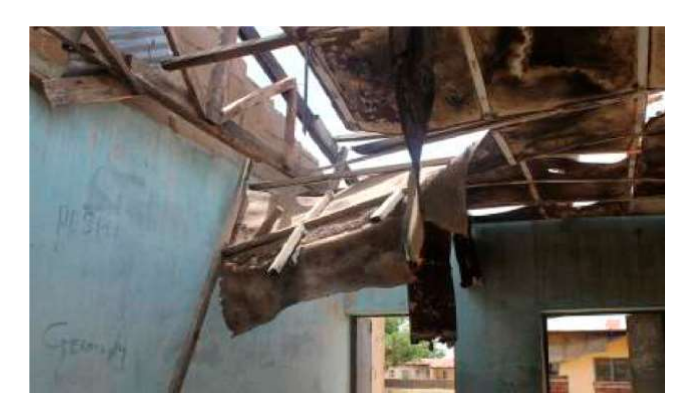
Government Technical School, Mubi