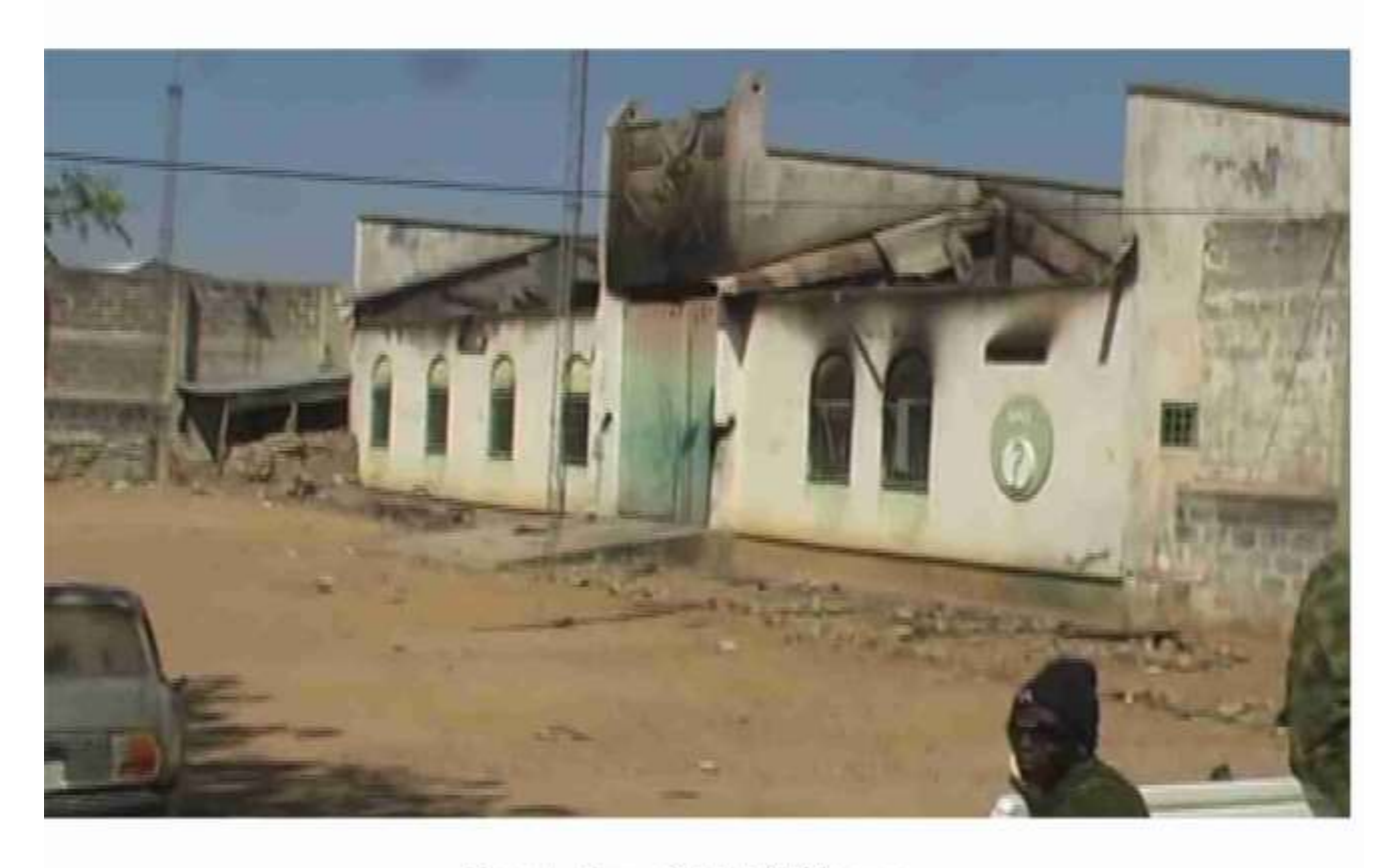
Front view of Mubi Prisons Page 7 of 10