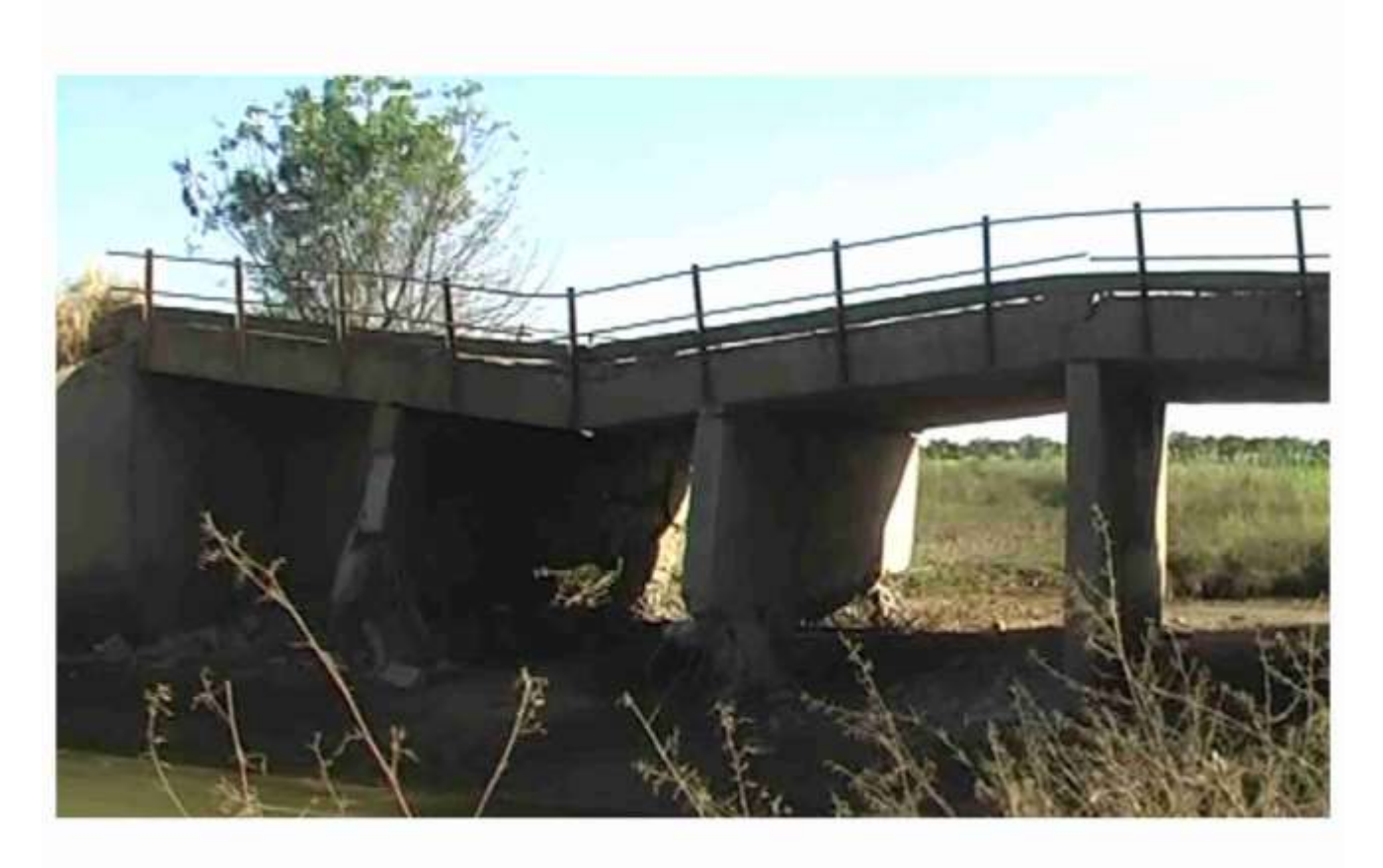
Some of the Bridges destroyed by the insurgents