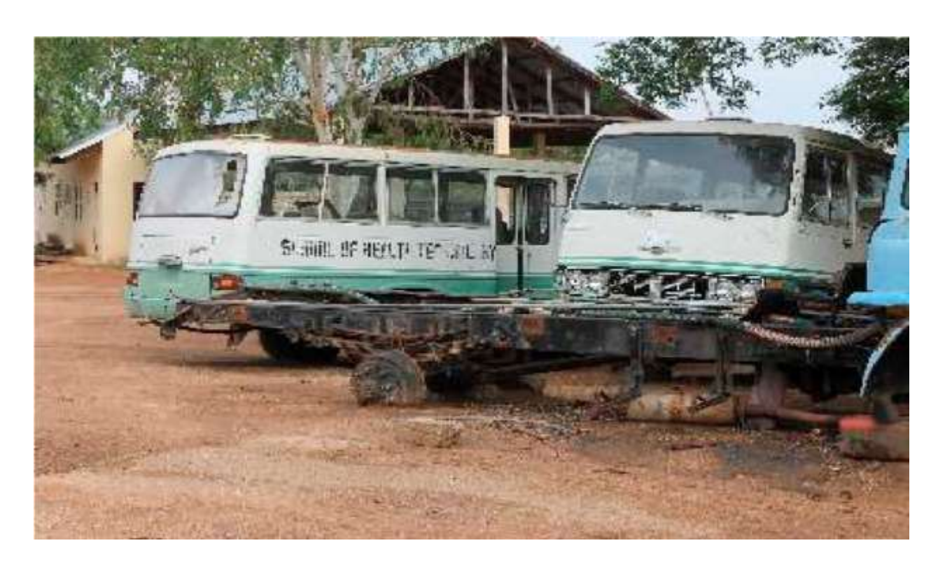
College of Health Technology, Mubi