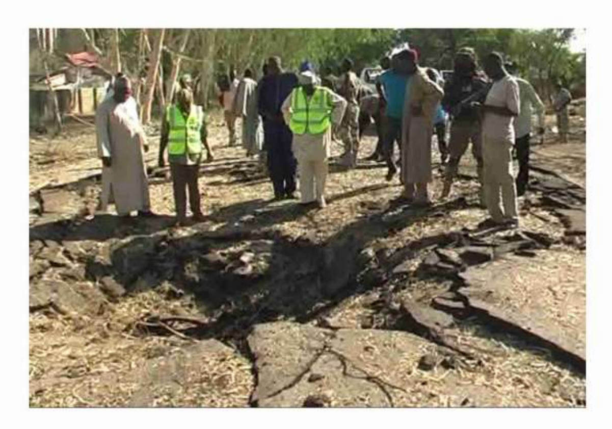
Inspecting scene of explosion along Mararaba Mubi Road