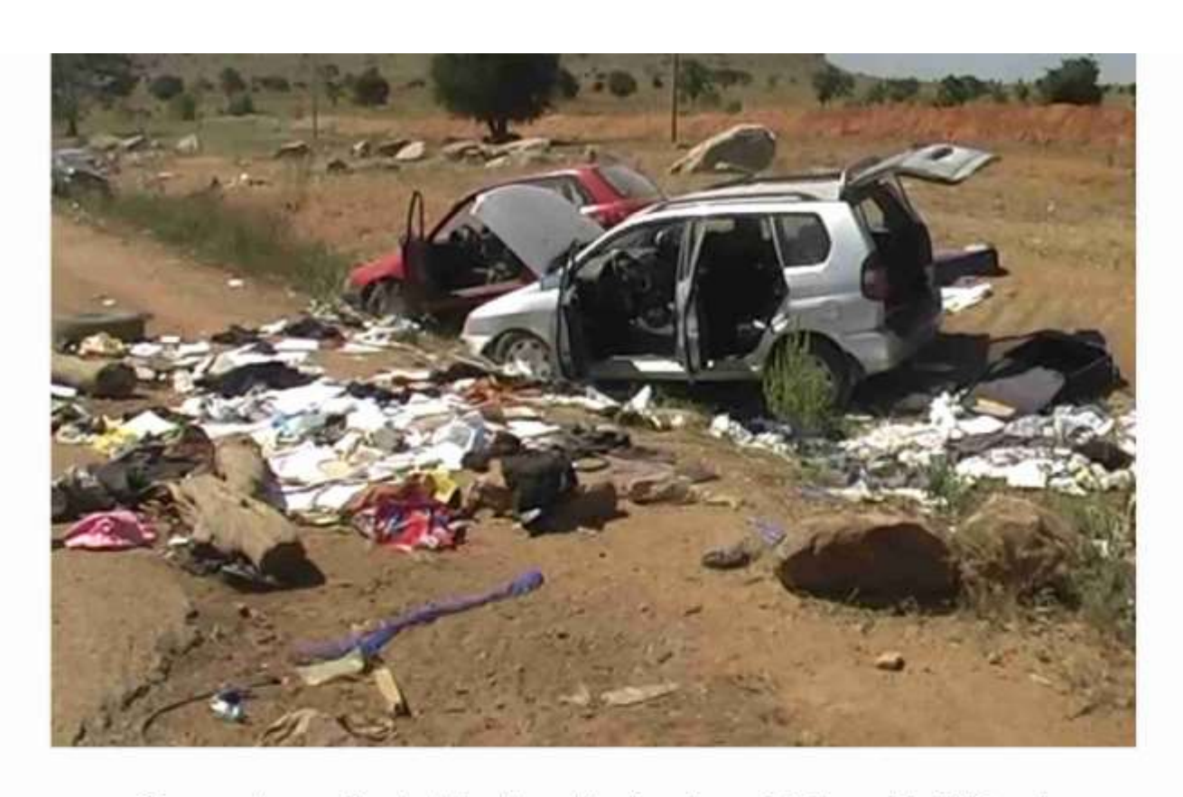
Commuters affected by the attacks along Maiha - Mubi Road